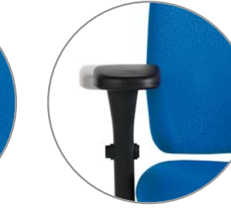
Armcap slides over top of seat